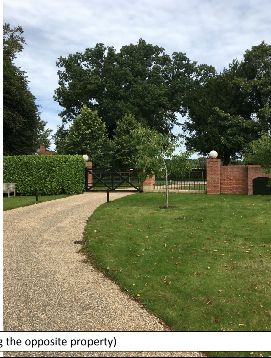
View from application site (showing the opposite property)