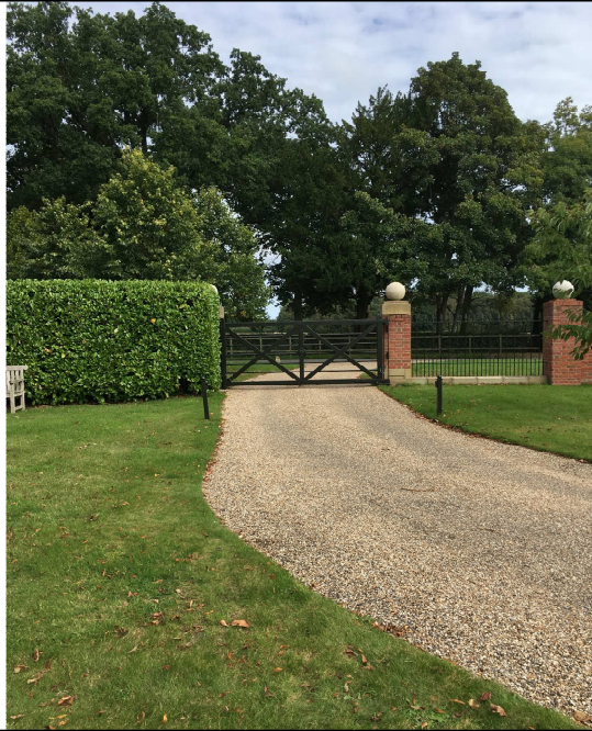
View of application site (existing gate and wall)

Photographs for Western Area Planning Committee Application 20/01620/FULD