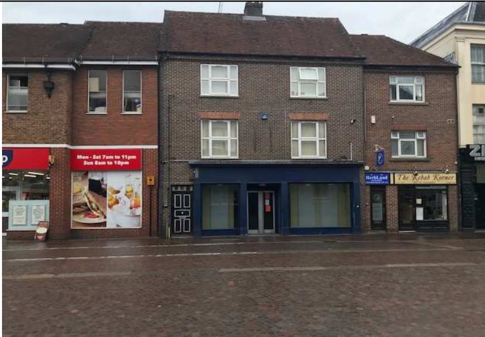
Front view of application site

Photographs for Western Area Planning Committee Application 20/01326/FUL & 20/01327/ADV