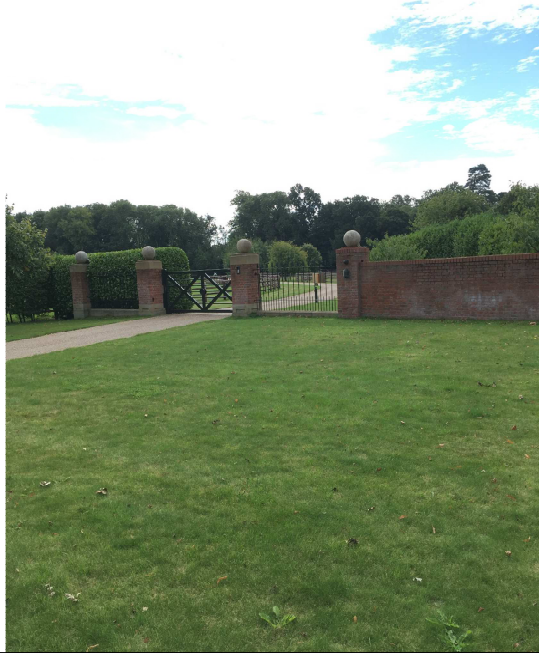
View from outside of application site 1