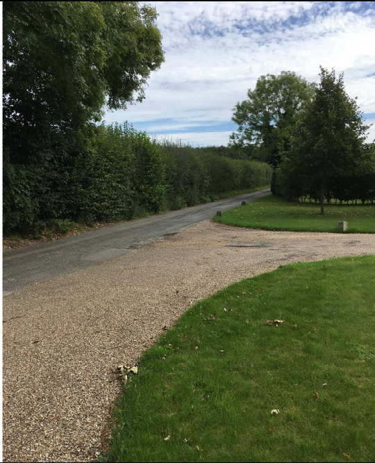
View of the access outside