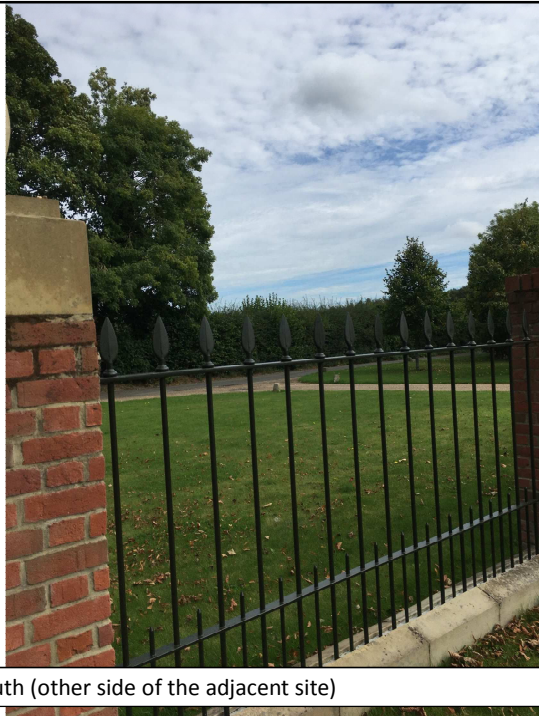
View from application site from south (other side of the adjacent site)