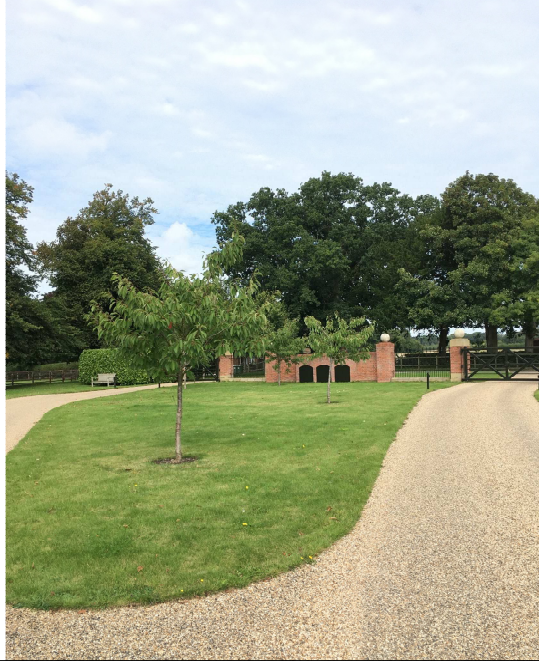
View of application site (from south)