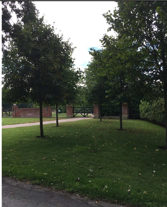
View from outside of application site 2