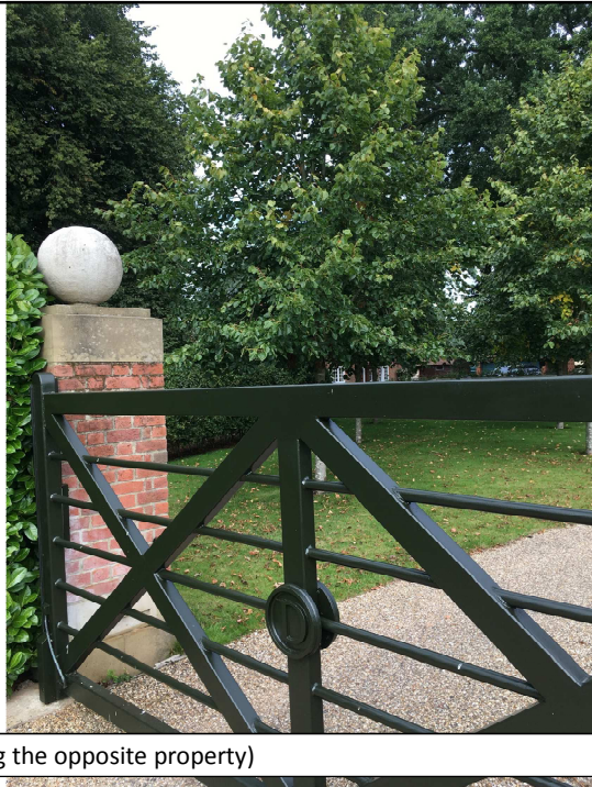
View from application site (showing the opposite property)