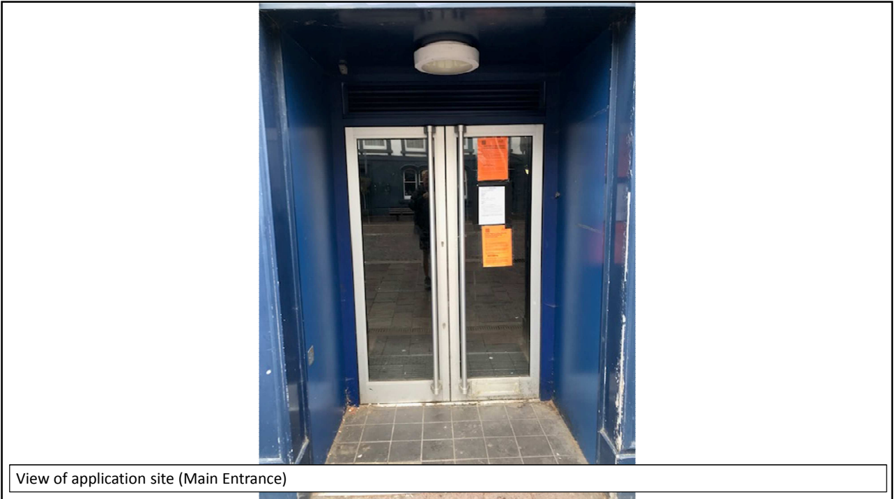
View of application site (Main Entrance)